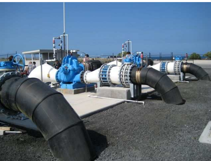
Rep. Belatti snapped this picture of the pumps that draw deep ocean water at the Big Island OTEC site.

Producing more energy is always an option, but reducing our use of energy is just as important to conserve our resources. Renewable energy technology can be used to do this.